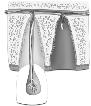
KNOCKED OUT TOOTH